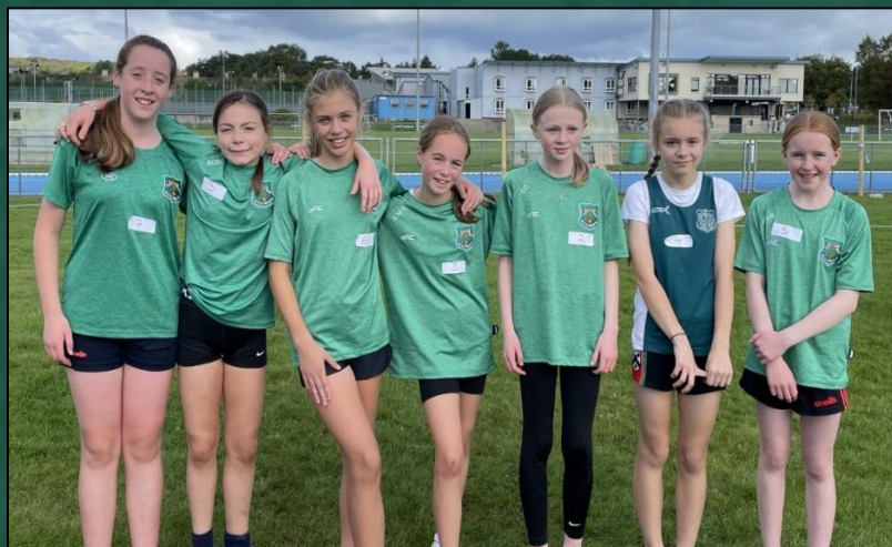
Year 8 Team