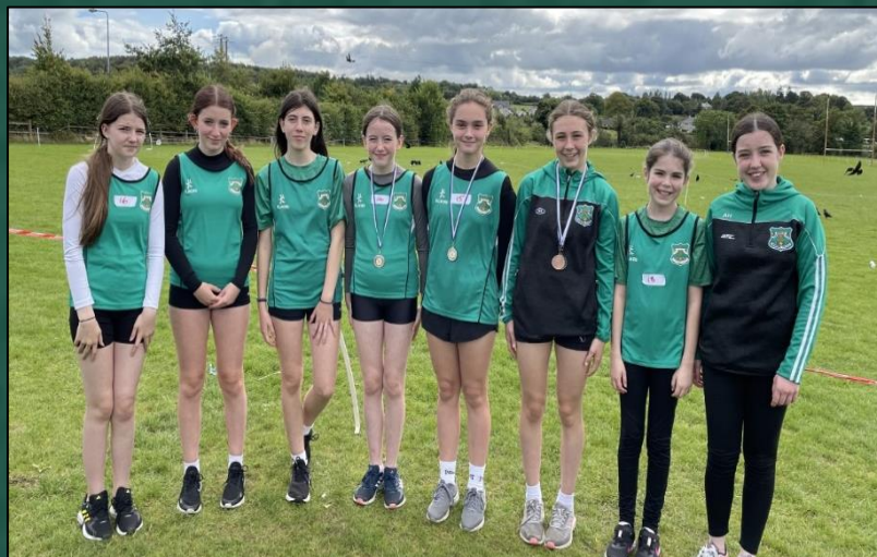
Year 10 Team