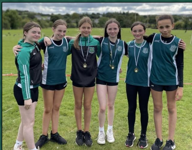
Year 9 Team